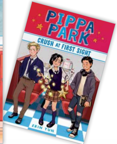
AR Quiz! Pippa Park Crush at First Sight #2 PB ISBN 978-1-944020-90-3 Also Available in HC, E & Audio