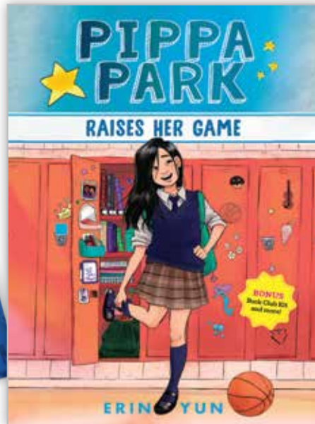
AR Quiz! Pippa Park Raises Her Game #1 PB ISBN 978-1-944020-28-6 Also available in HC, E & Audio